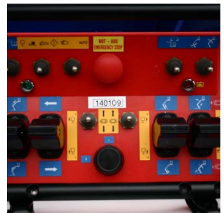
User-friendly remote control with colour coded functions