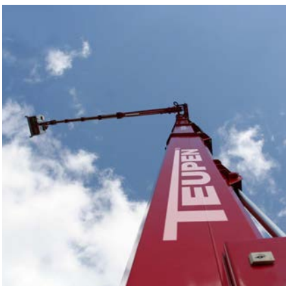
Upper and lower boom can be operated independently