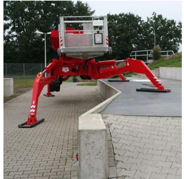
Setting up on ground slopes up to 16,7° / 30,0 %