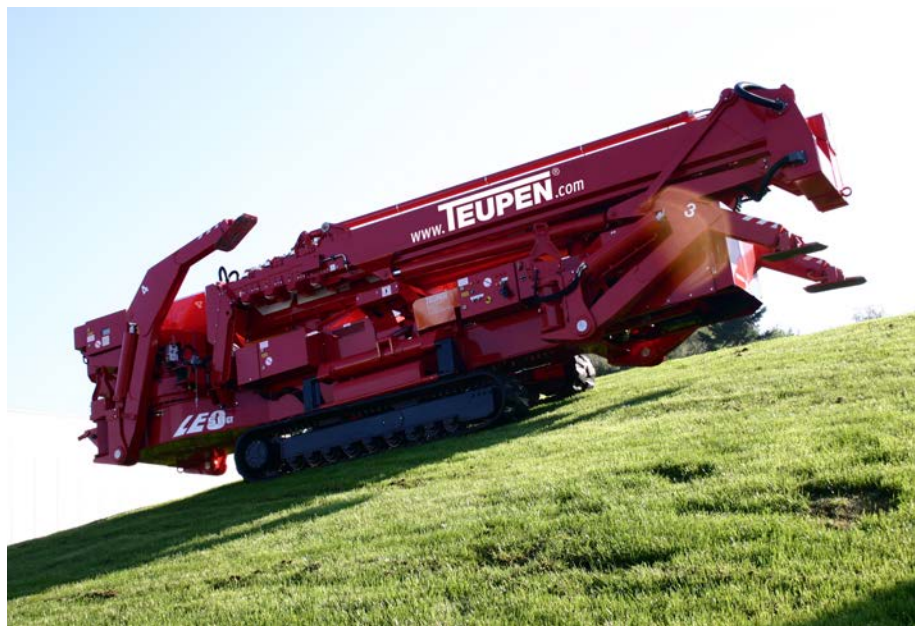
Gradeability of 16,7° / 30,0 %