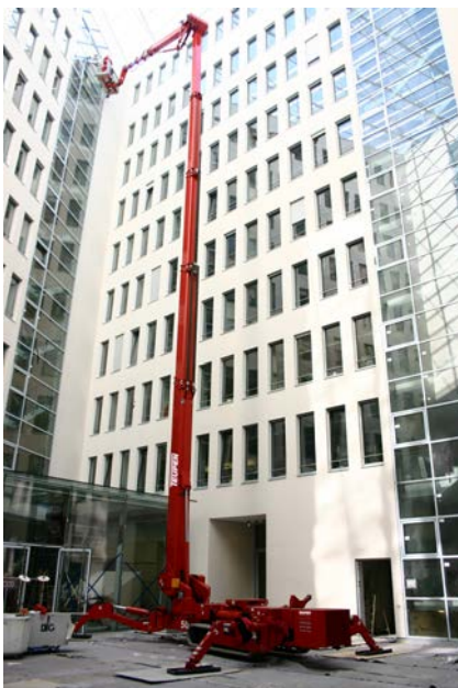
Versatile - perfect tool to complete jobs more efficiently